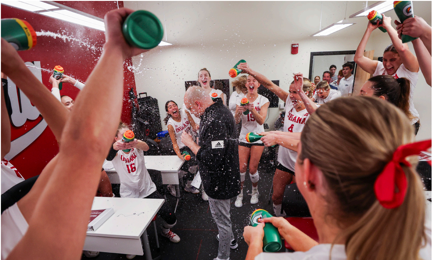
Indiana Volleyball after a win over Purdue in 2023.