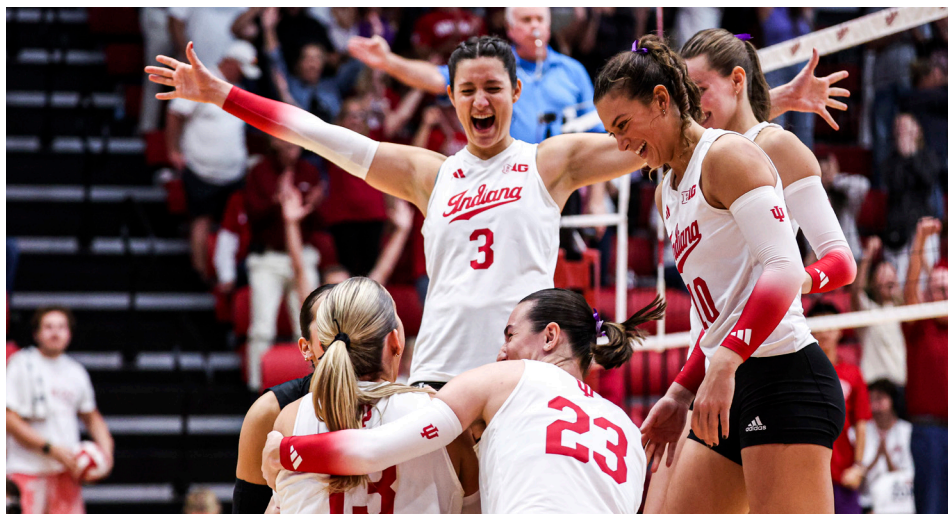
Indiana in a win over Ohio State at Wilkinson Hall.