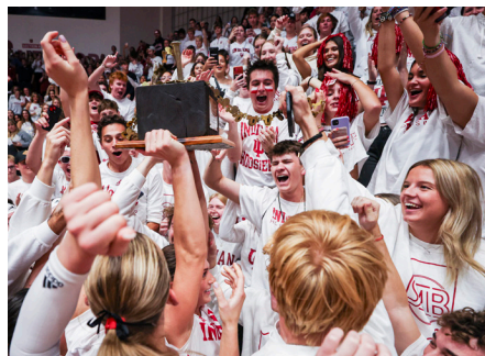
IU students celebrate a win over #15 Purdue in 2023.