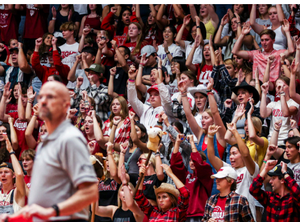
Wilkinson Hall sold-out vs. #2 Nebraska in 2023