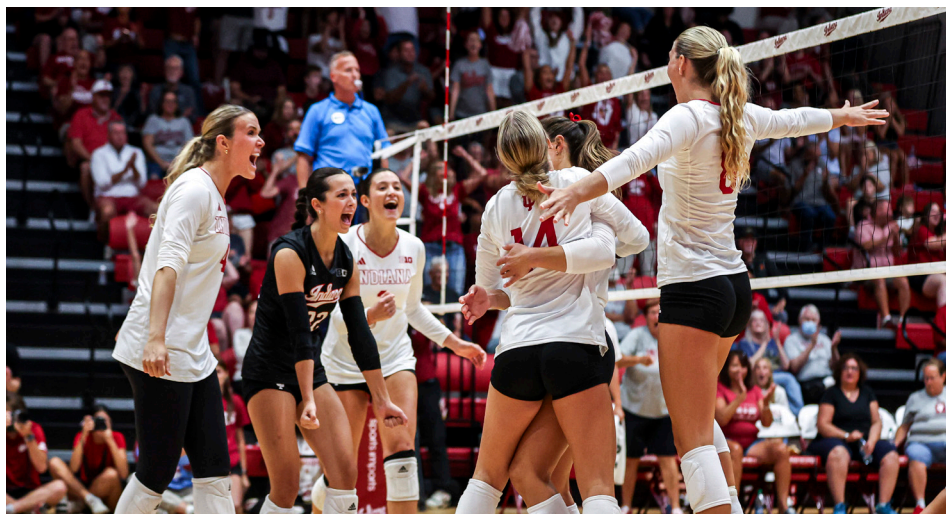
Indiana in a win over UC Davis at Wilkinson Hall.