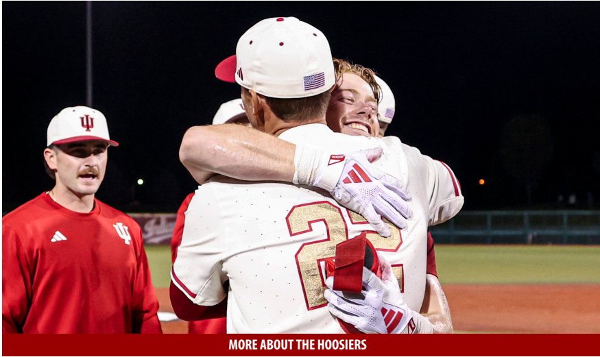
MORE ABOUT THE HOOSIERS