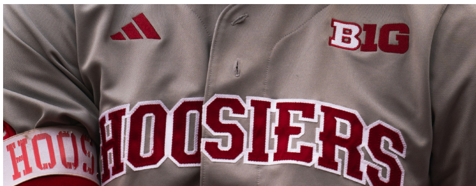
IU's traditional all grey uniforms; often worn on Friday or Saturday nights in road contests