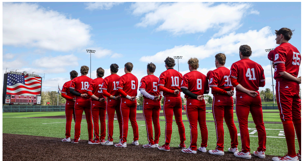
Indiana's team during the national anthem against Rutgers.