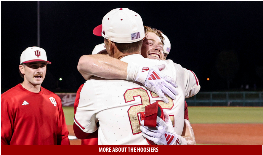
MORE ABOUT THE HOOSIERS