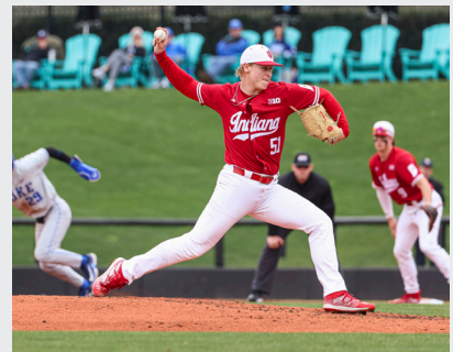
This is the third time in five years (2022 - at Clemson, 2024 - vs. Duke) that IU will play an ACC team on Opening Day.