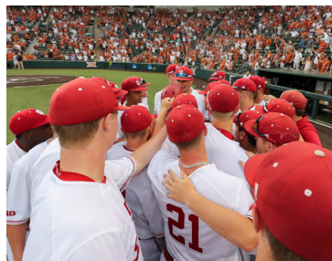
The Hoosiers visited No. 13 Texas in the 2018 NCAA Tournament