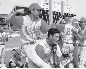
Indiana celebrates the 1996 Big Ten Tournament title