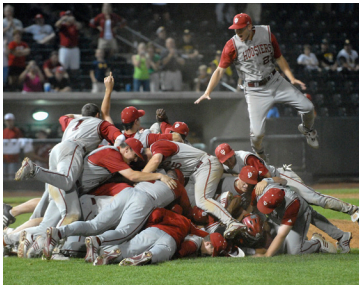
Indiana wins the 2009 Big Ten Tournament