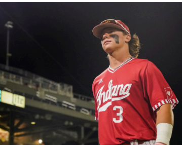
Indiana and Rutgers played a game that began well after midnight in Omaha